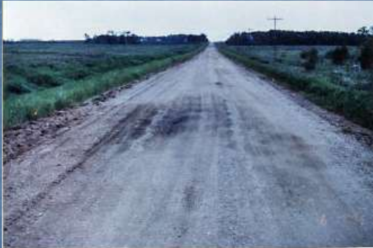
(Photographs of gravel-surfaced roadways in poor condition)