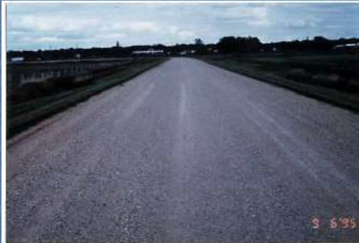
(Photographs of gravel-surfaced roadways in excellent condition)