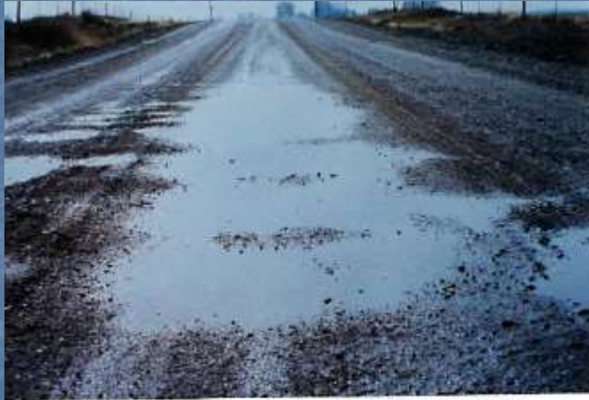
(Photographs of gravel-surfaced roadways in failed condition)