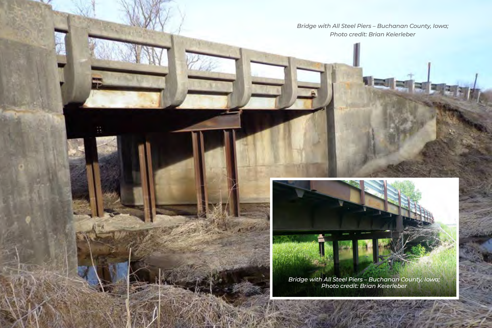
Bridge with All Steel Piers – Buchanan County, Iowa