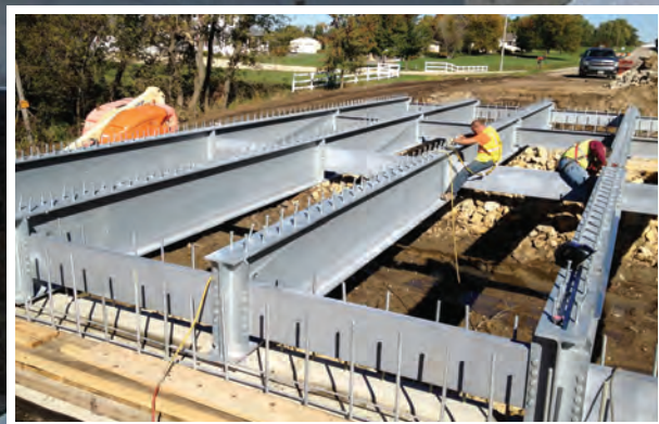
Construction of Bridge with Galvanized Steel Beams – Buchanan County, Iowa