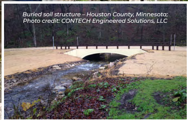
Buried soil structure – Houston County, Minnesota; Photo credit: CONTECH Engineered Solutions, LLC