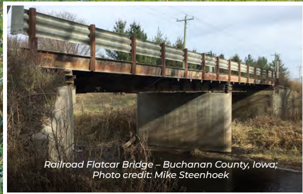
Railroad Flatcar Bridge – Buchanan County, Iowa