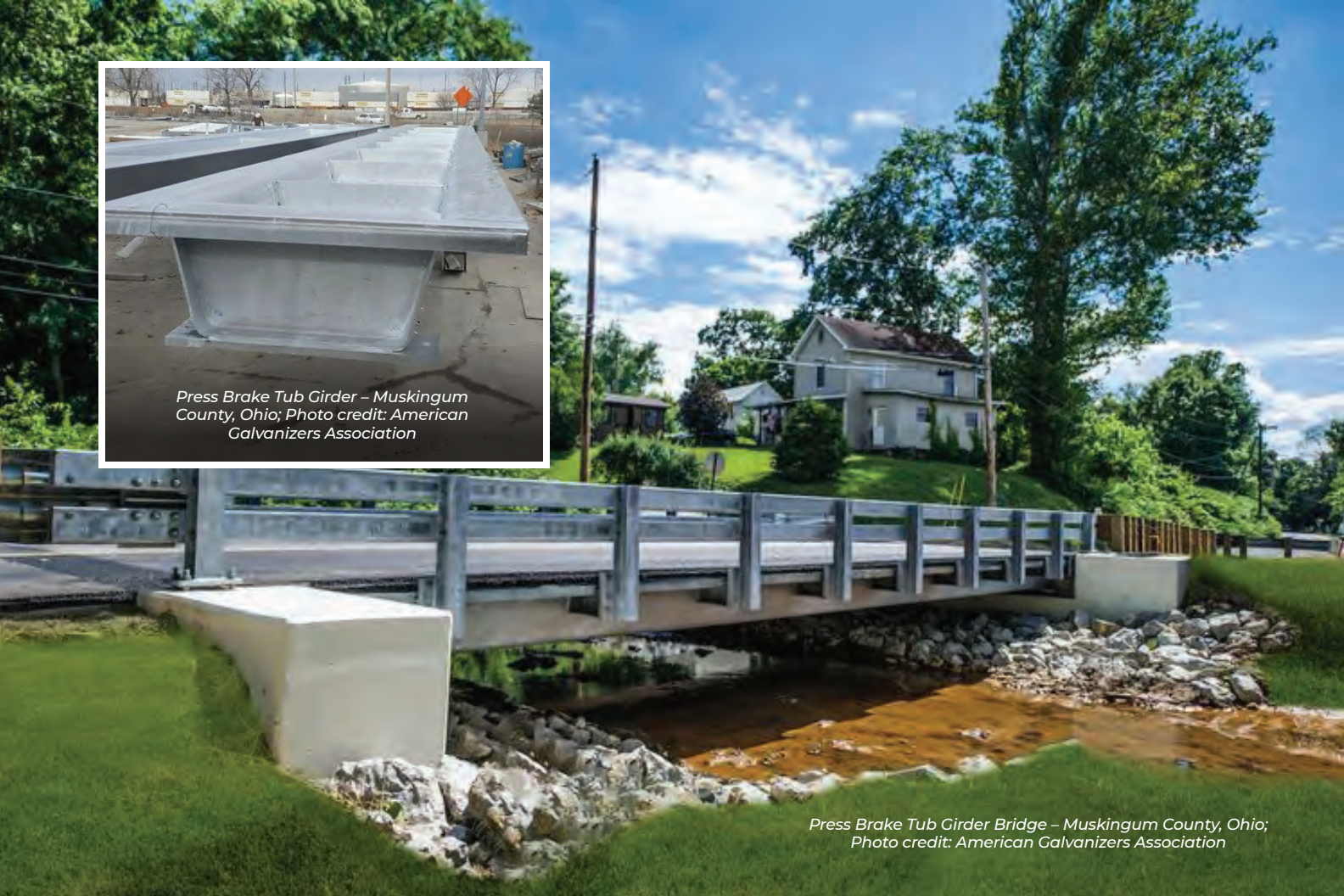
Press Brake Tub Girder Bridge – Muskingum County, Ohio