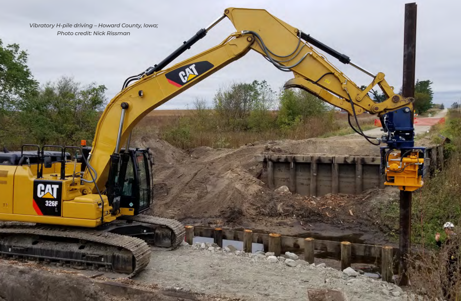
Vibratory H-pile driving – Howard County, Iowa; Photo credit: Nick Rissman