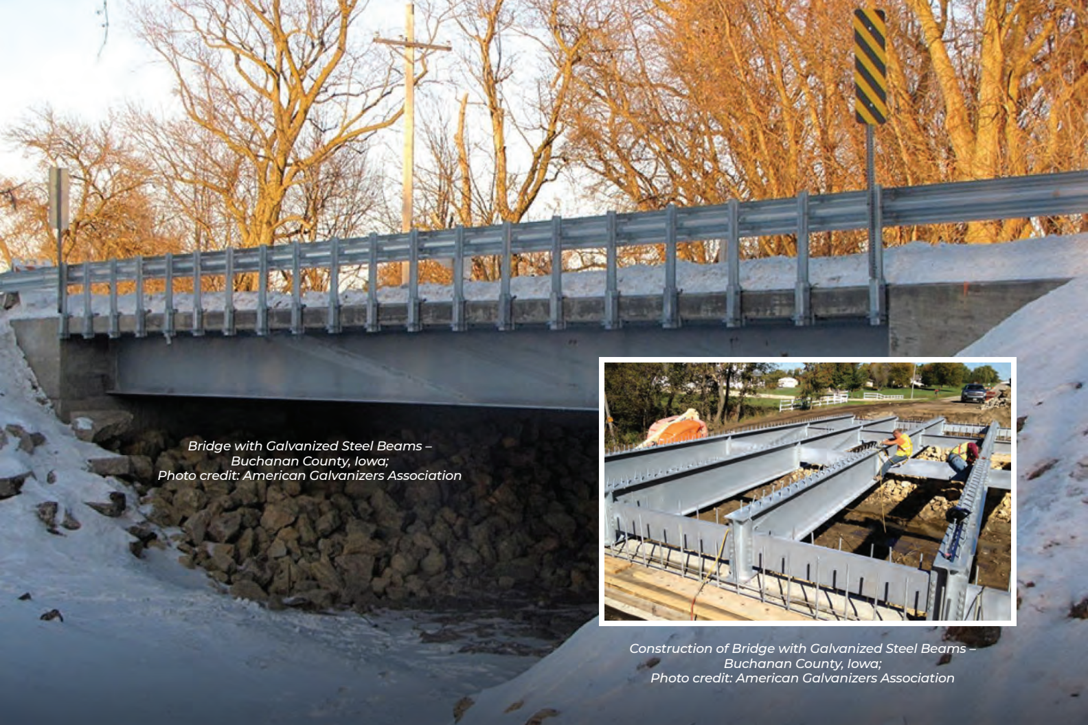
Bridge with Galvanized Steel Beams – Buchanan County, Iowa; Photo credit: American Galvanizers Association