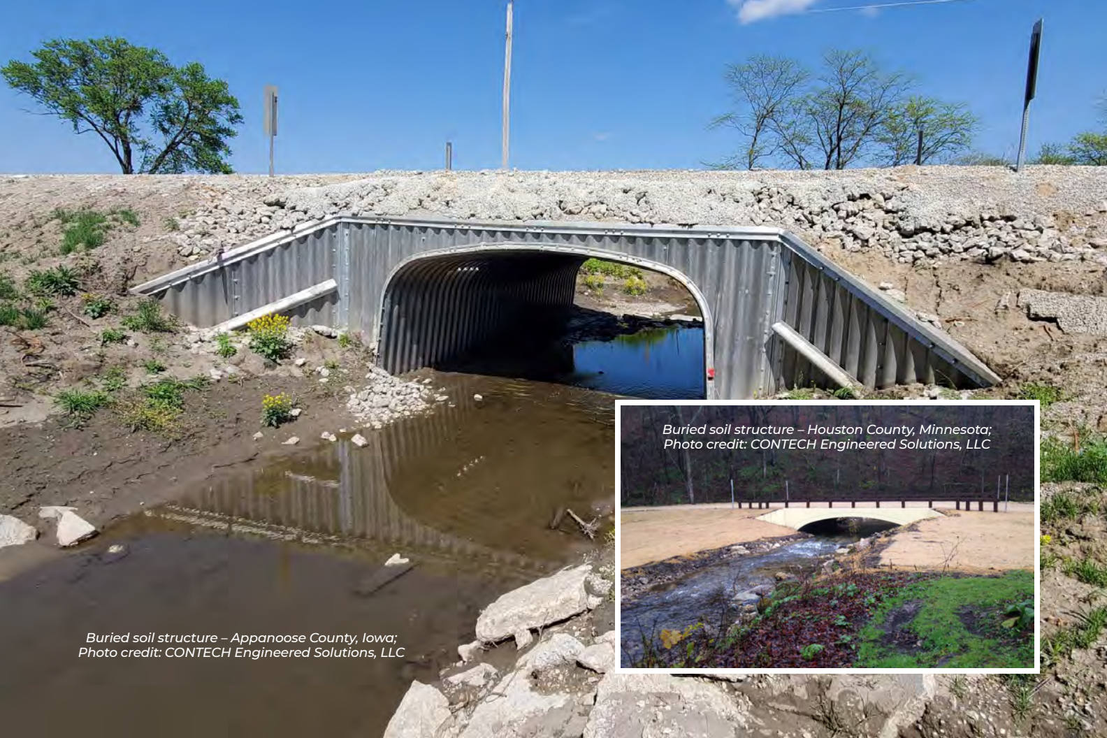
Buried soil structure – Appanoose County, Iowa