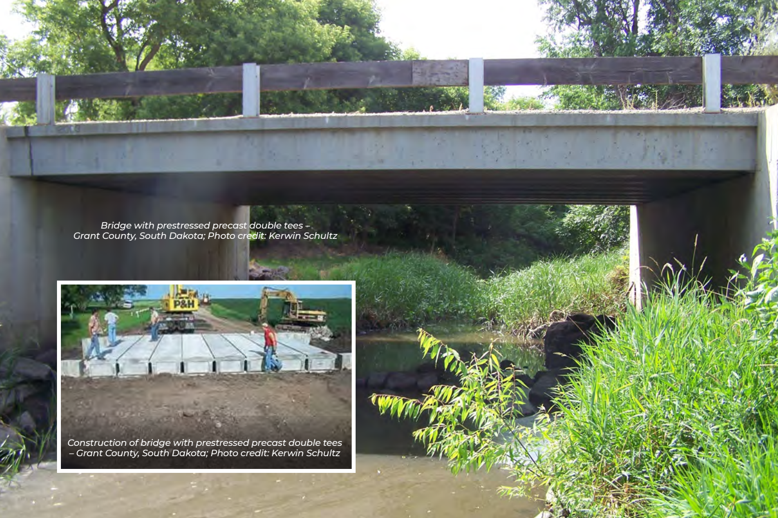
Bridge with prestressed precast double tees – Grant County, South Dakota; Photo credit: Kerwin Schultz