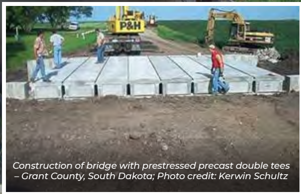
Construction of bridge with prestressed precast double tees – Grant County, South Dakota; Photo credit: Kerwin Schultz