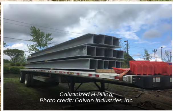
Galvanized H-Piling