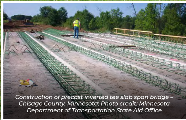
Construction of precast inverted tee slab span bridge – Chisago County, Minnesota; Photo credit: Minnesota Department of Transportation State Aid Office