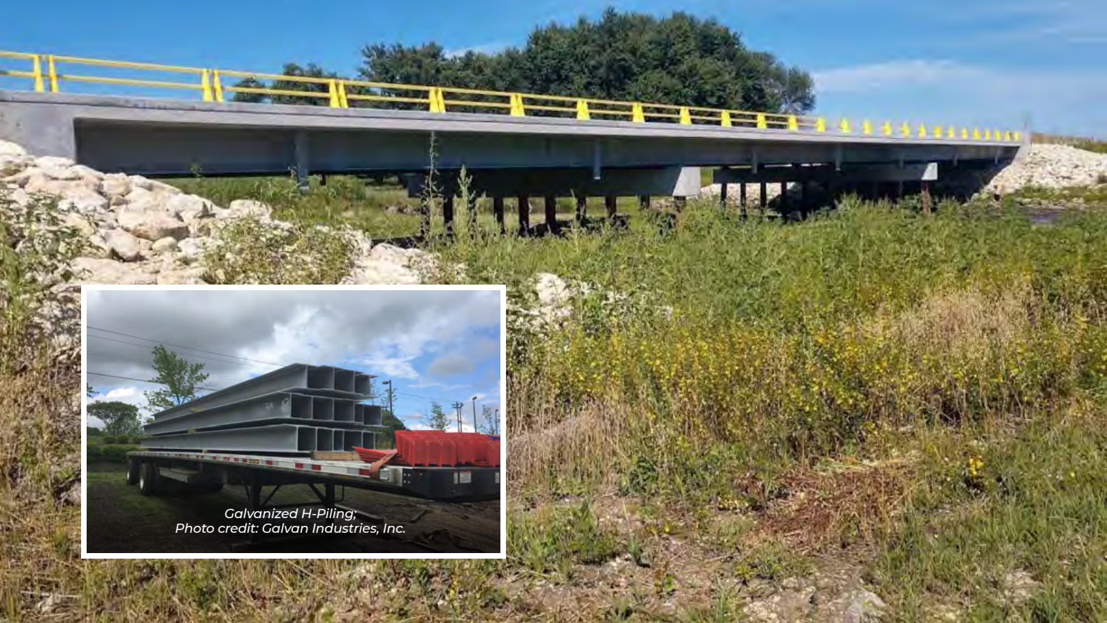
Completed bridge with galvanized H-Piling – Buchanan County, Iowa