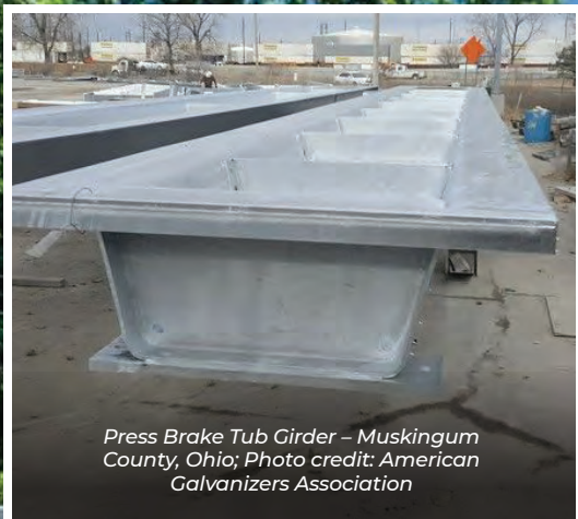
Press Brake Tub Girder – Muskingum County, Ohio