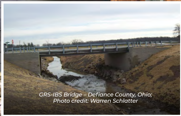
GRS-IBS Bridge – Defiance County, Ohio