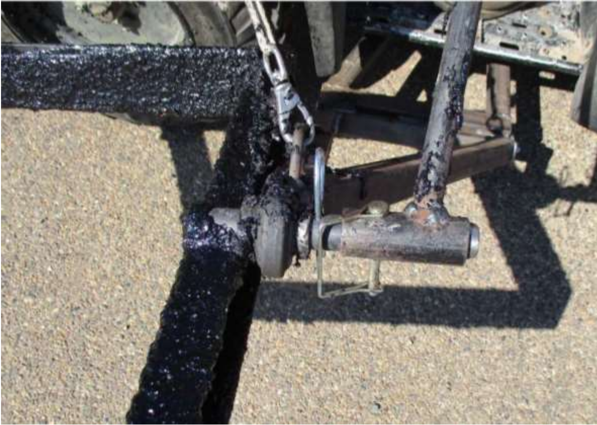
Rearview of material box in working position.