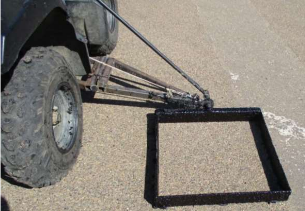
Filling box with mastic material.