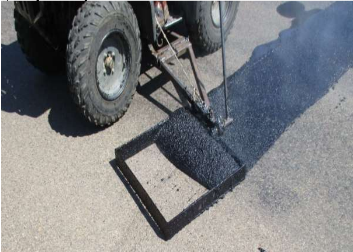
Material box partially raised for short transport.