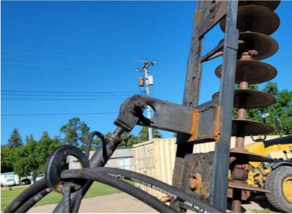
Hinge allows disc frame arm to flex