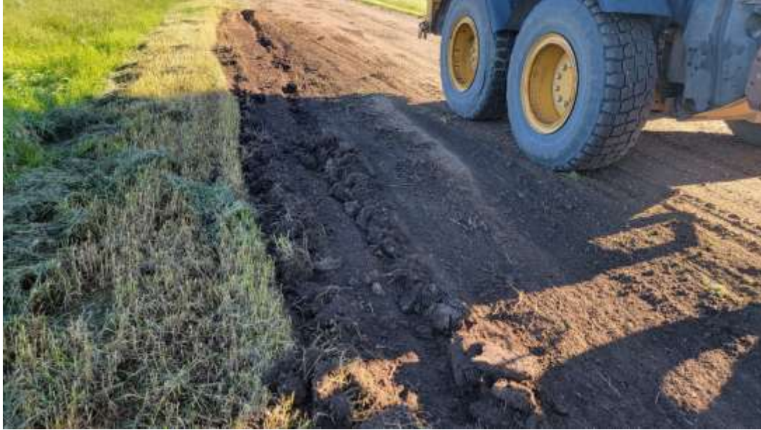
Hydraulic side disc