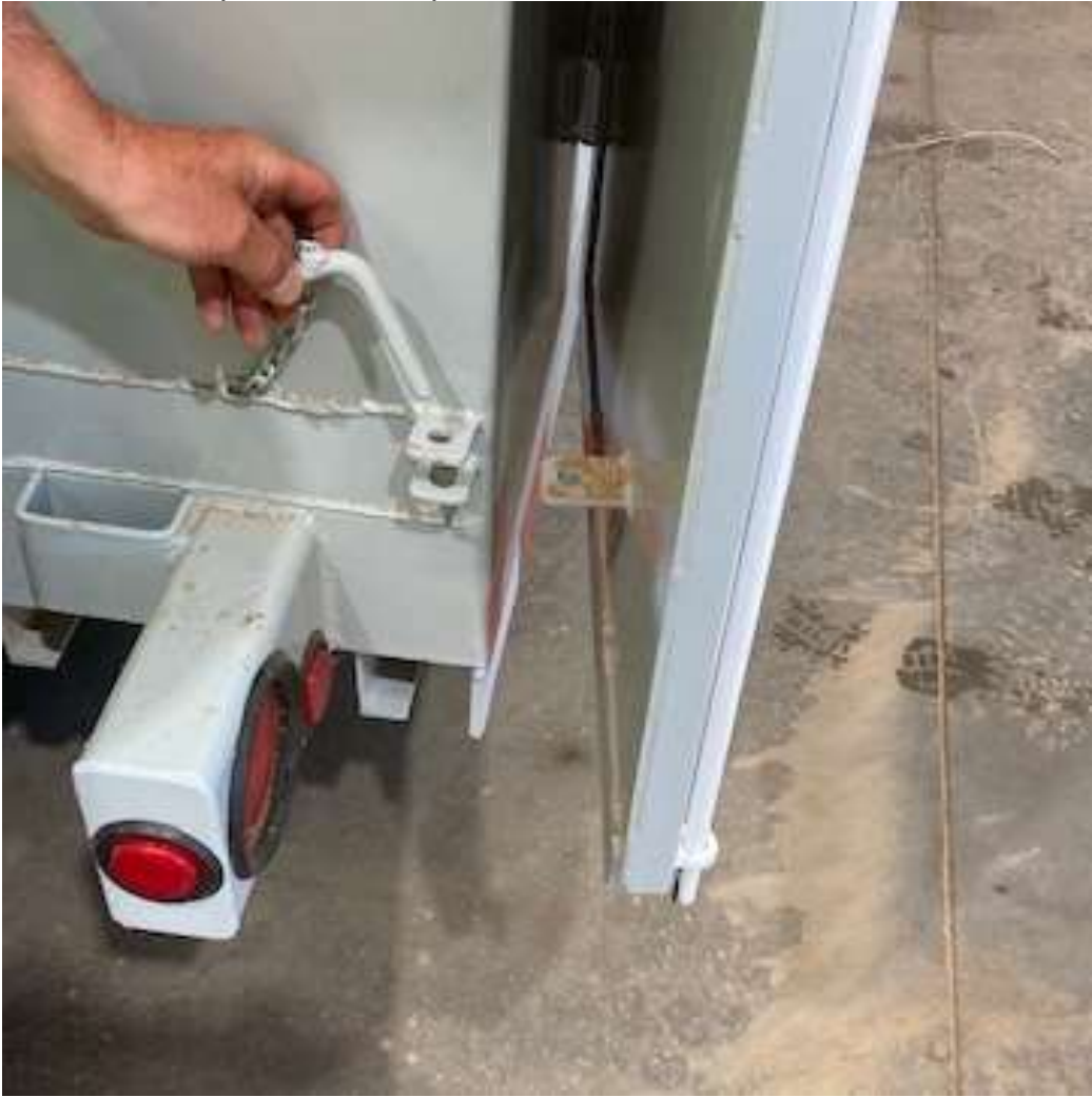
Holders to keep rear doors open