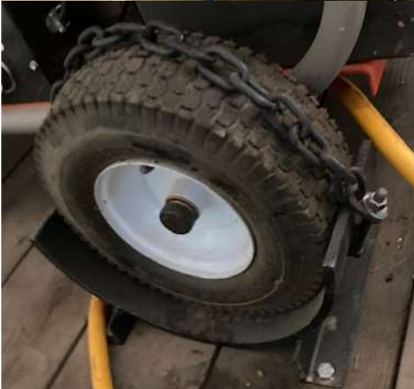
Power washer/water heater unit tie down