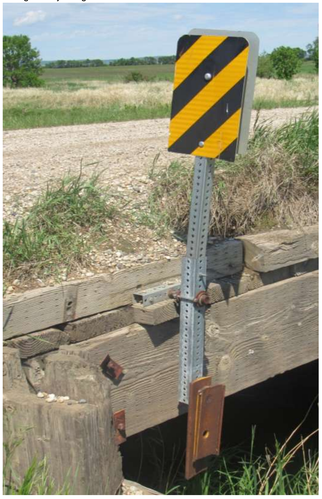
Swing-A-Way Bridge Marker.