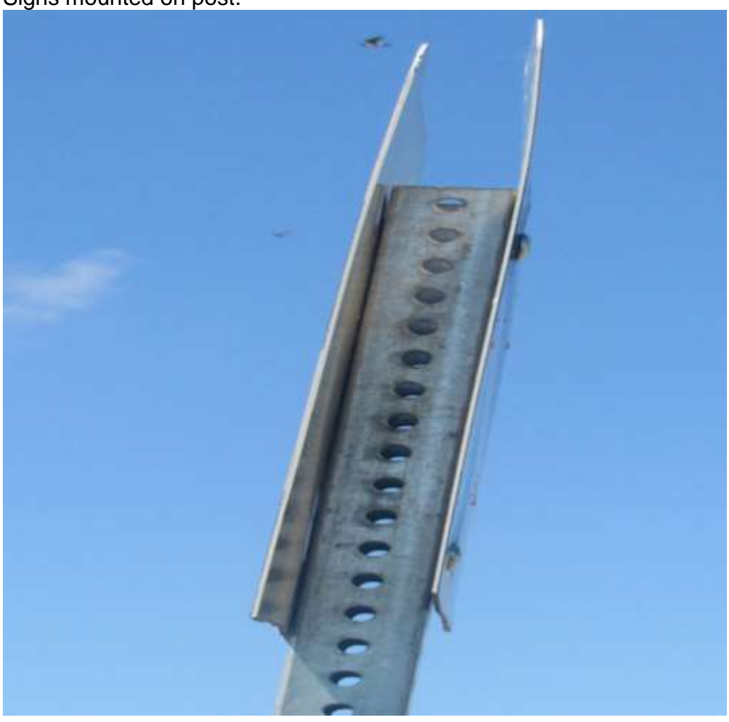
Video link <a href="https://drive.google.com/open?id=1M4YgiSjGtR88jAWK8IX6fkWP6NsOUO1A">https://drive.google.com/open?id=1M4YgiSjGtR88jAWK8IX6fkWP6NsOUO1A</a>

https://drive.google.com/open?id=1z-yUxyua_aw7kzq9pdT6ai78WhPJLKB4