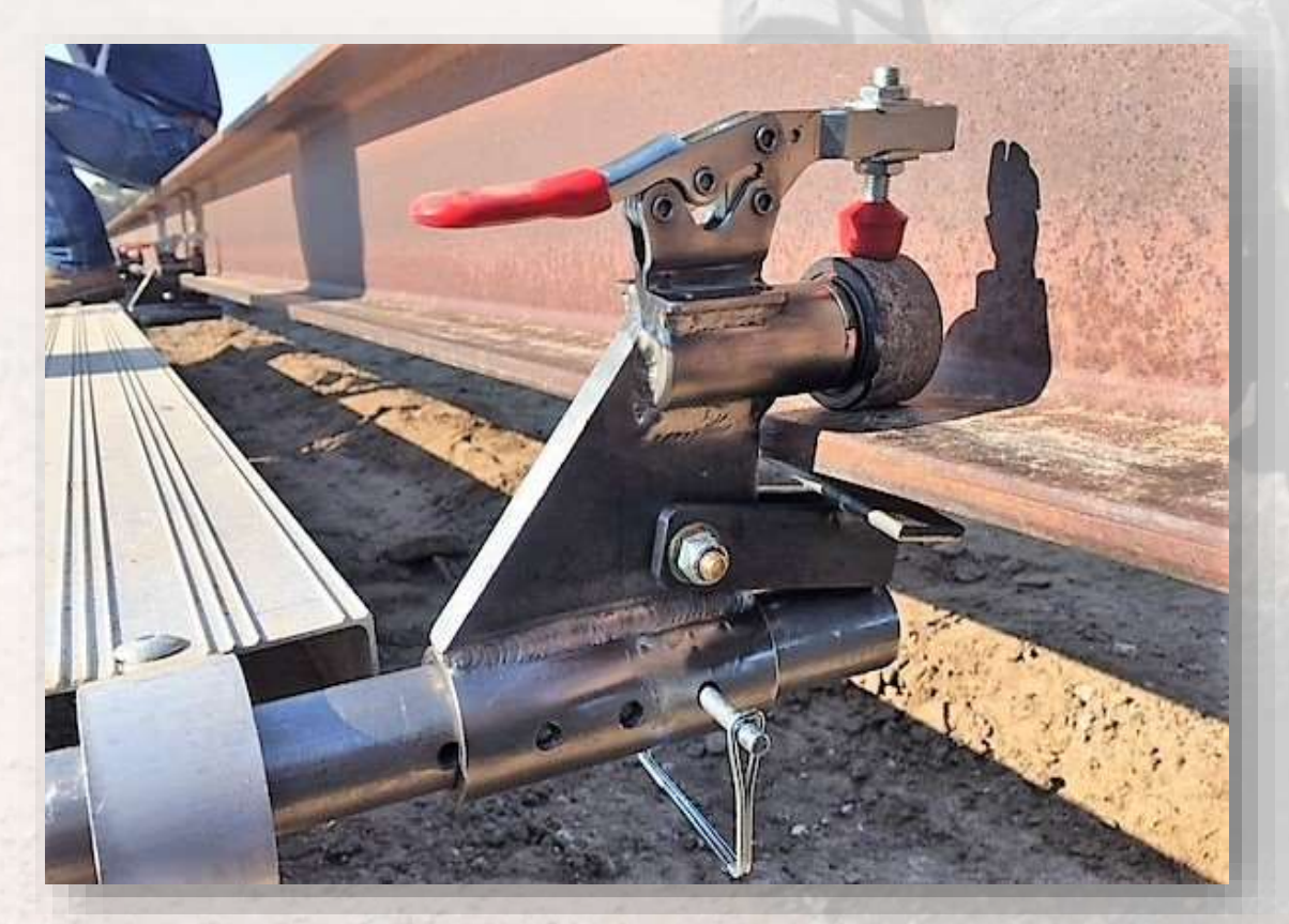
2018 North Central Local Roads Conference