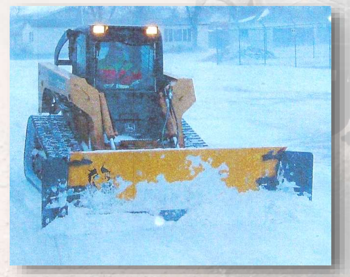
2018 North Central Local Roads Conference