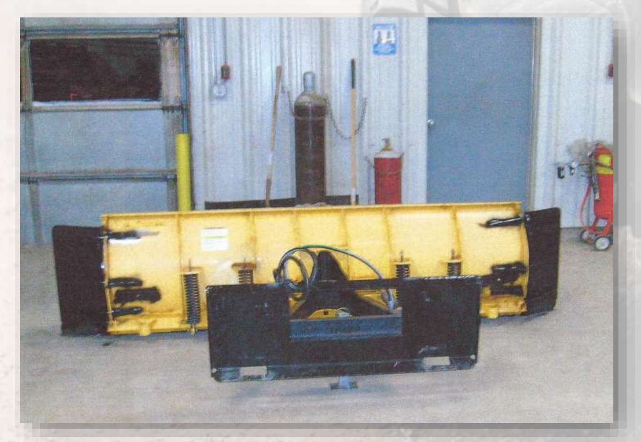
2018 North Central Local Roads Conference