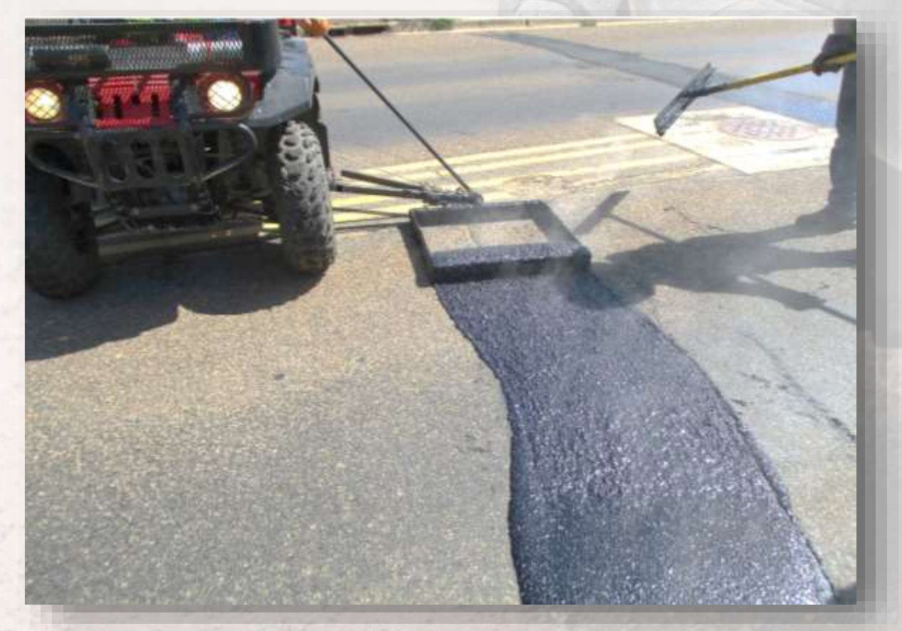
2018 North Central Local Roads Conference