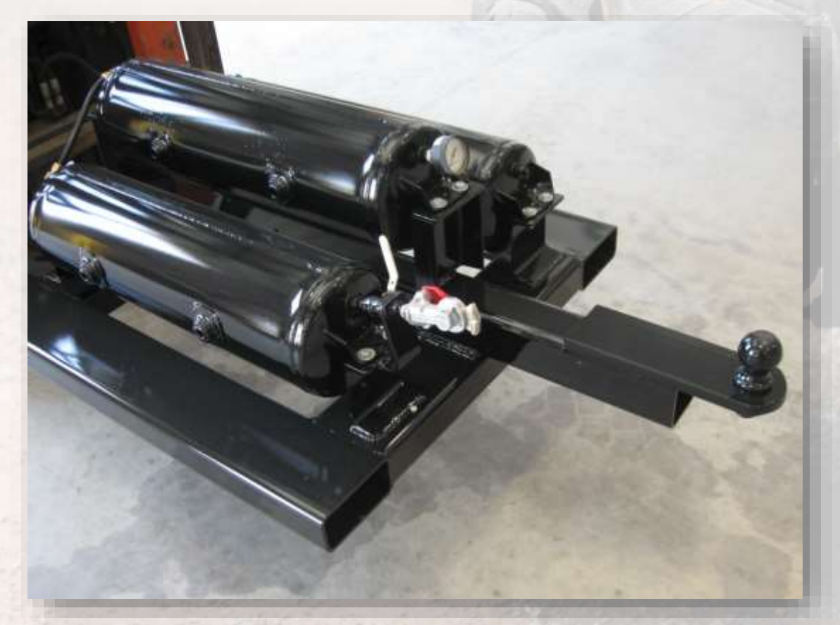
2018 North Central Local Roads Conference