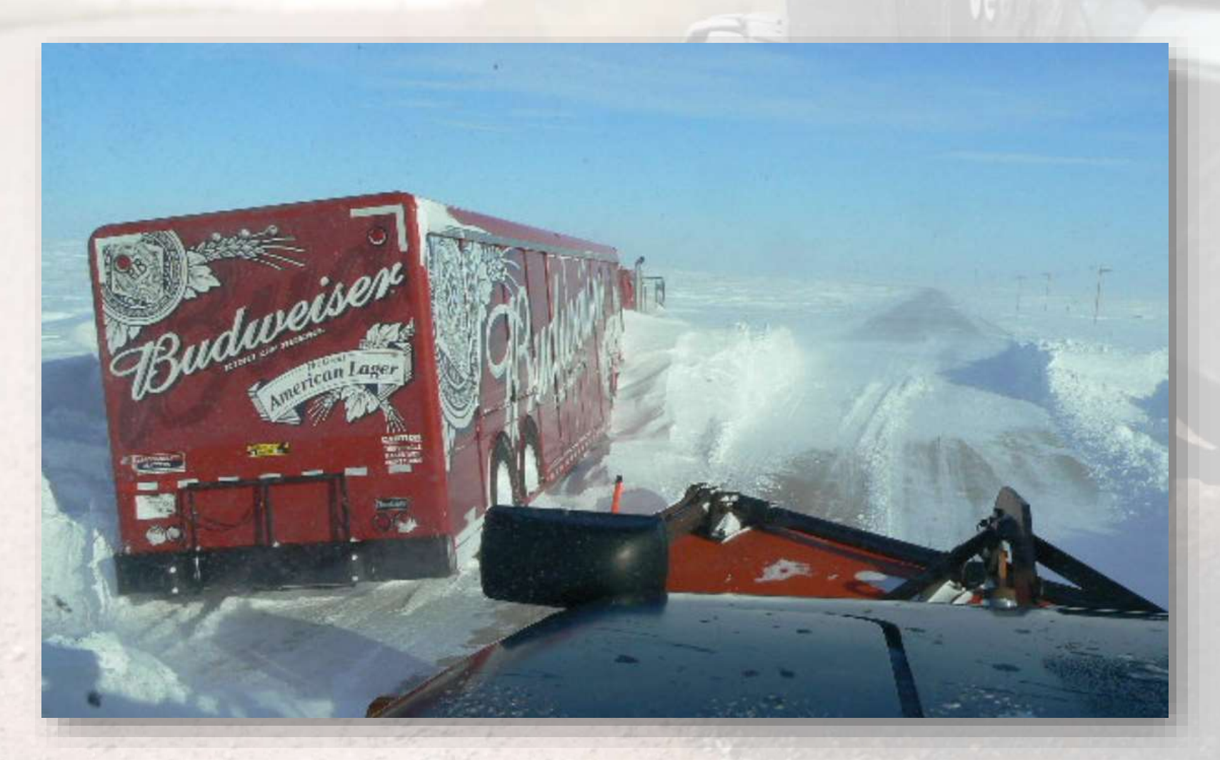
2018 North Central Local Roads Conference