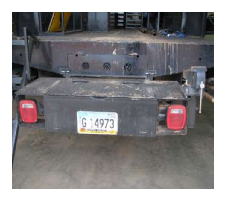
Work Bench with Vise