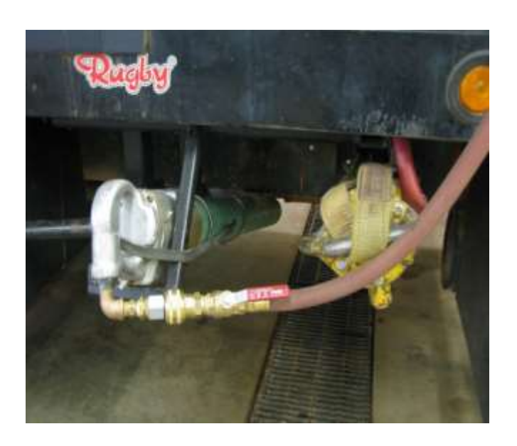
Holders for Air Hammer and Auger