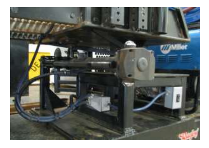
Camper Jack and Pivot Hub

The redesigned sign truck changes the signing operation from a two person to a one person operation. The changes to the catwalk and holders for the air hammer and auger; and redesigning the ladder reduces the exposure to injuries to employees. All the changes increase the efficiency of the signing operation and the reduction to possible bodily injury is a great benefit to employees and saves the county money in possible workers compensation costs.