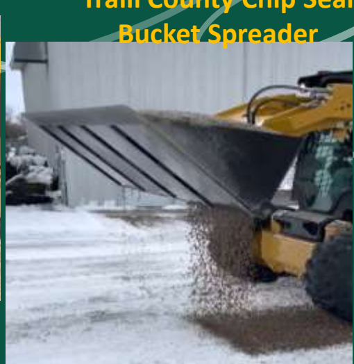
Ham County Chip Seal Bucket Spreader