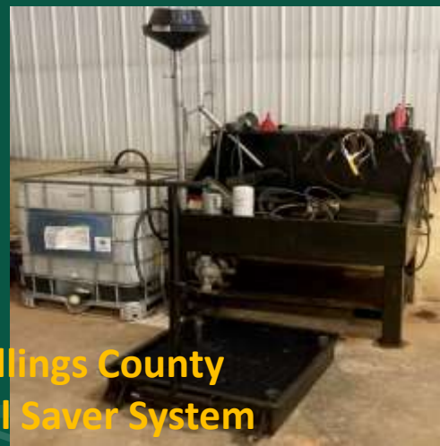
Billings County Oil Saver System