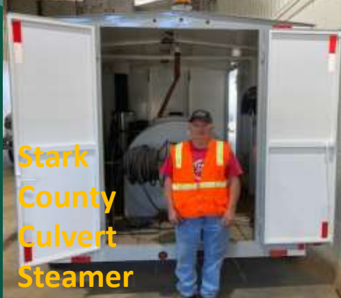
Stark County Culvert Steamer