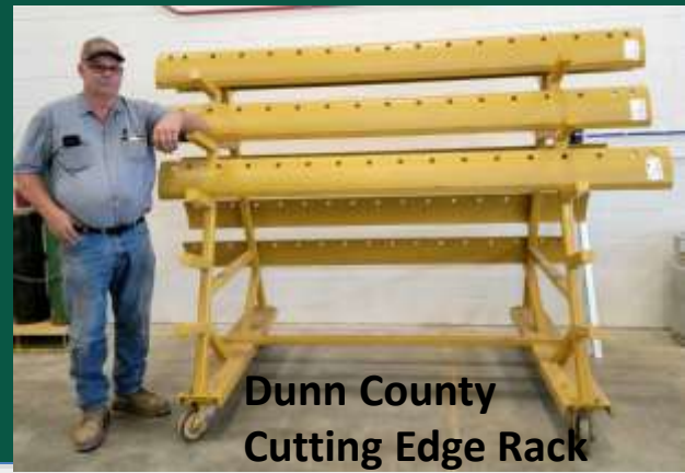
Dunn County Cutting Edge Rack